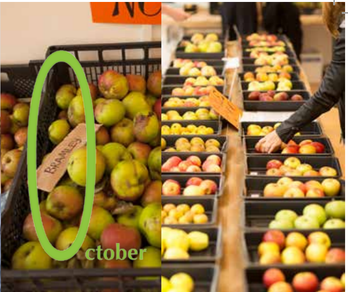
...to our displays...