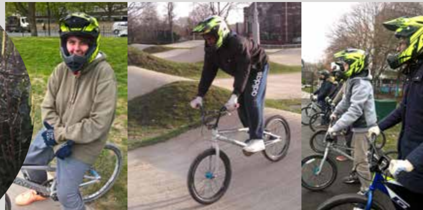
Late winter seems to have been full of action - BMX training with Access Sports at Burgess Park (weekly sessions at the impressive track designed with funding from London 2012 Paralympics) and Boxercise, a weekly workshop via Southwark Disability Sports at Castle Gym. This is run by Simone and is a real hit with students.