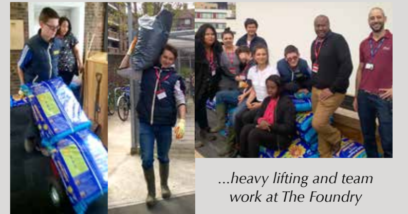
...heavy lifting and team work at The Foundry