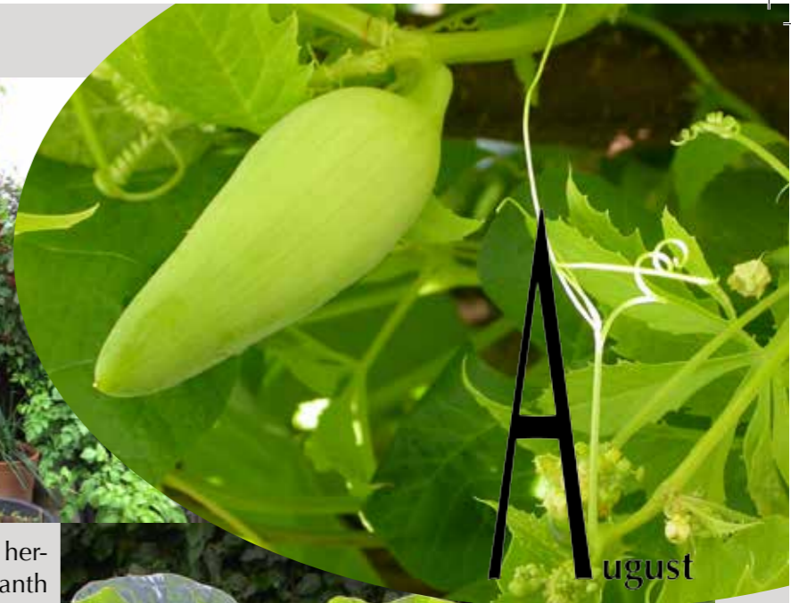
Sarah grew unusual and heritage crops such as amaranth and achocha as well as kale, tomatoes and french beans, in the beds and a range of containers including dustbins. The giant cabbage was a variety ideal for coleslaw and sauerkraut and was also very beautiful. Careful seed planning for the next year will bring more education projects to the beds.