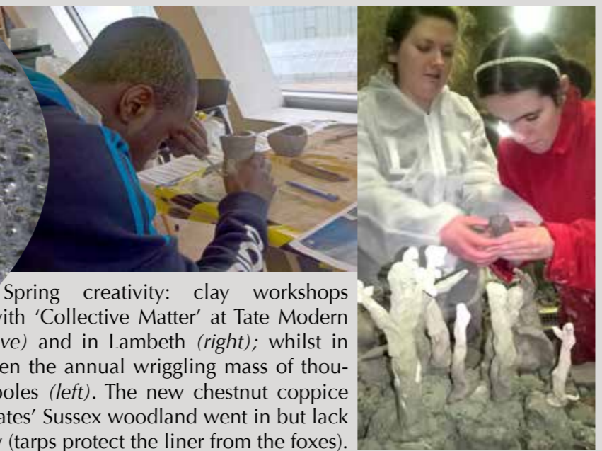
Spring creativity: clay workshops with 'Collective Matter' at Tate Modern (above) and in Lambeth (right); whilst in the garden the annual wriggling mass of thousands of tadpoles (left). The new chestnut coppice fence from Andy Coates' Sussex woodland went in but lack of rain kept the water level low (tarps protect the liner from the foxes).