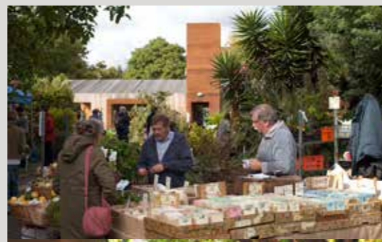
...and a relaxing day of music, food, gifts, Keith and the Amazing Crumbucket Dragon Machine...